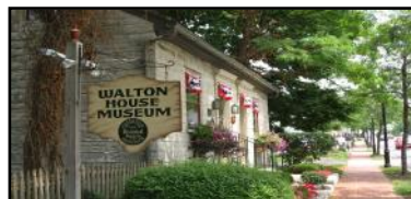
Walton House, Built 1838

Surveyed in 1796, the Centerville and Washington Township area has spanned the eras of the pioneer, the farmer, the villager and the suburbanite, evolving and growing while preserving pieces of its unique past.