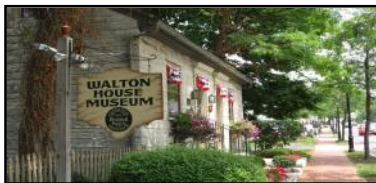
Walton House, Built 1838

Surveyed in 1796, the Centerville and Washington Township area has spanned the eras of the pioneer, the farmer, the villager and the suburbanite, evolving and growing while preserving pieces of its unique past.